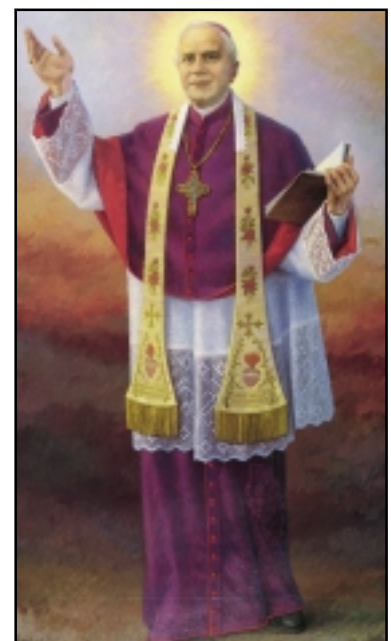
Joseph Sebastian Pelczar 1842-1924

In 1899, he became an auxiliary bishop and, in 1900, local Ordinary of the Diocese of Przemysl. He was beatified on June 2, 1991, in Rzeszow, Poland and canonized on May 18, 2003, by Pope John Paul II.