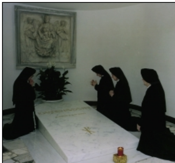
Right: Surrounding him once again, the Sisters who worked for Pope John Paul II at the papal household are seen at his tomb in the crypt of St. Peter's Basilica, Rome.