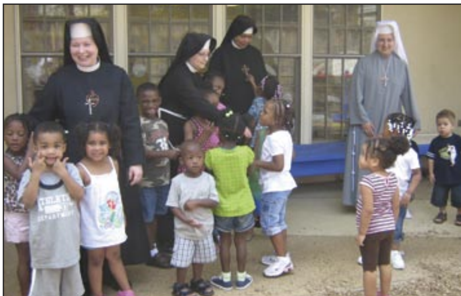
At the Guardian Angel Child Care, Wilmington, DE.