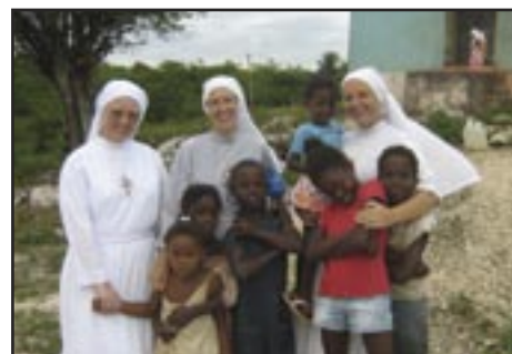
Sisters with children in the village of Maggoty.

We remember all of our Sisters and Benefactors