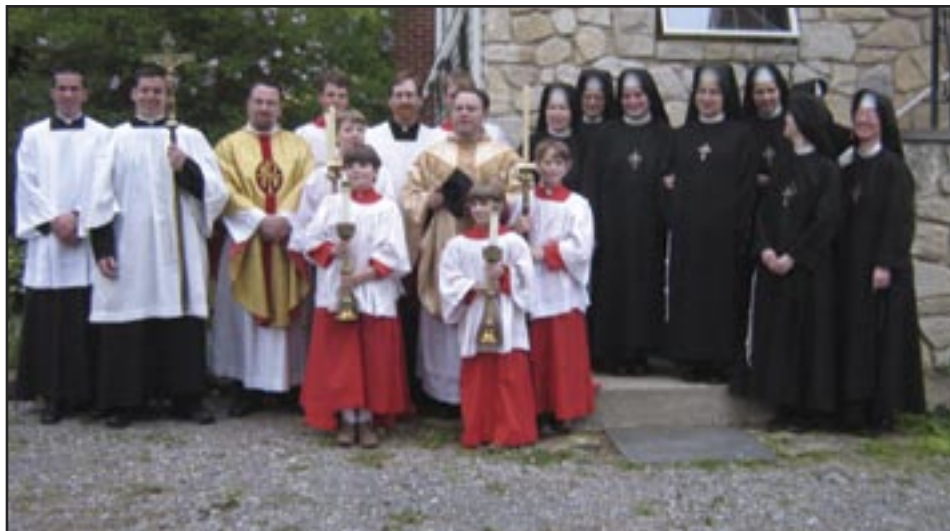
The Solemnity of the Most Sacred Heart of Jesus, May 30, 2008, before our Provincial Chapel, Cresson, PA.