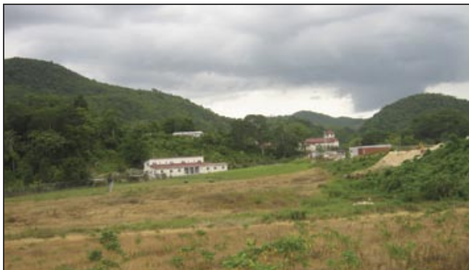
The village of Maggotty, Jamaica, where the Sisters live and work – can be seen: church, convent, and rectory.

Presently, our Sisters provide education and catechetical instruction to improve morality and, hopefully, effect a more stable family life and good future for the people of Jamaica. They also provide basic and much-needed free health services for the people at a simple clinic run by our Sisters in Maggotty. Our Sisters are further involved with outreach to the poor in the villages, as they seek to be a witness of hope to those in need, spiritually, materially and morally. Considering our unlikely but now very real presence in the Caribbean and the tremendous work our Sisters are accomplishing there, it is safe to say today that Father Marek's meeting with us in 1999 was by far "no accident" but very much part of the plan of the Sacred Heart of Jesus.