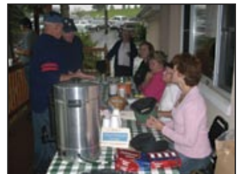
Registration featured Breakfast and Snacks donated by Mount Aloysius College , Cresson, PA.

In-kind donations included: Amici’s & Bogartz Restaurants ; Damin Printing ; Ebensburg Country Club ; Iron Masters , Roaring Springs, PA; Mid’s Candy & Gifts ; Oakmont Country Club ; Summit Country Club ; Sunnehanna Country Club ; and Velenty Bottled Water, Co.