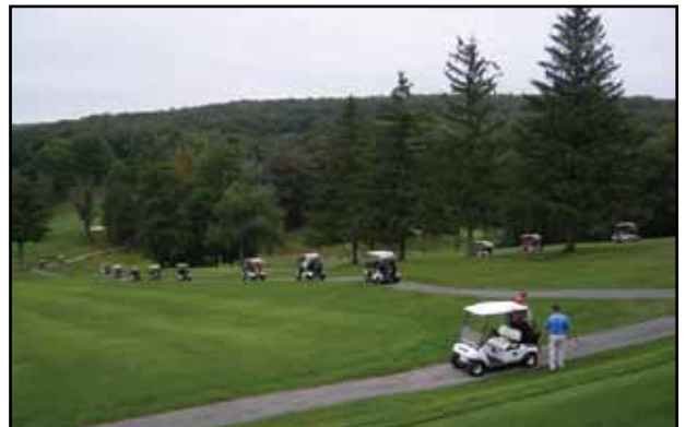
Off with a bang!