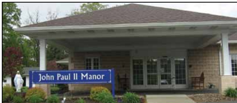
John Paul II Manor, a residential assistance care center conducted by our Sisters.