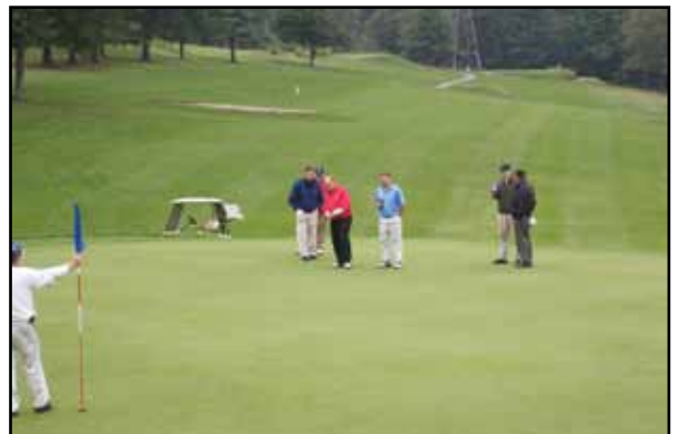
A "hole" lot of fun.