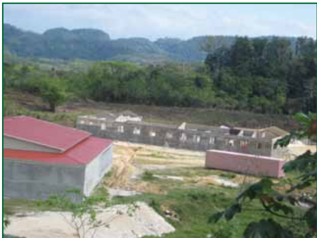
The construction of the Sisters' new clinic and the parish sausage factory at the Jamaican mission.

Holy Spirit Mission anticipates the completion of two major projects this year: a new clinic and sausage factory! Both projects were funded by generous individuals and organizations from around the world, including the Holy Father, Pope Benedict XVI's own mission fund, Cor Unum.