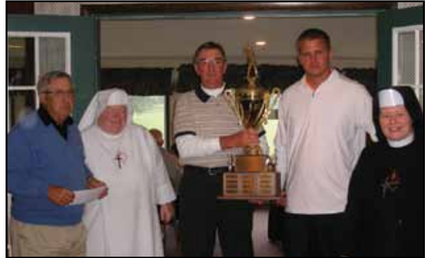
St. Aloysius Parish takes the gold!

Amici's • Bedford Springs Golf Course • Ebensburg Country Club • Glen Garry Golf Links • Immergrun Golf Course • Iron Masters, Roaring Springs • Lena's Restaurant • Mount Aloysius College • Oakbrook Golf Course • Scotch Valley Country Club • Sinking Valley Country Club • Summit Country Club • Sunnehanna Country Club • Windber Country Club • Valenty Bottled Water