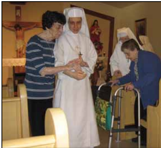
Sisters helping the residents at our John Paul II Manor, Cresson, PA.

As Servants who remain before the Heart of Jesus in loving contemplation, adoration and intercessory prayer, the Sisters witness to the Lord's unlimited love in our daily community life and contact with others. As the visible sign of our religious consecration, we wear a full habit with scapular and veil, rosary, Franciscan cord, crucifix, and ring.