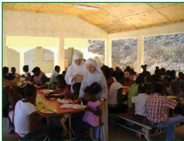
Providing lunch for children at the parish community center, Maggotty, Jamaica.