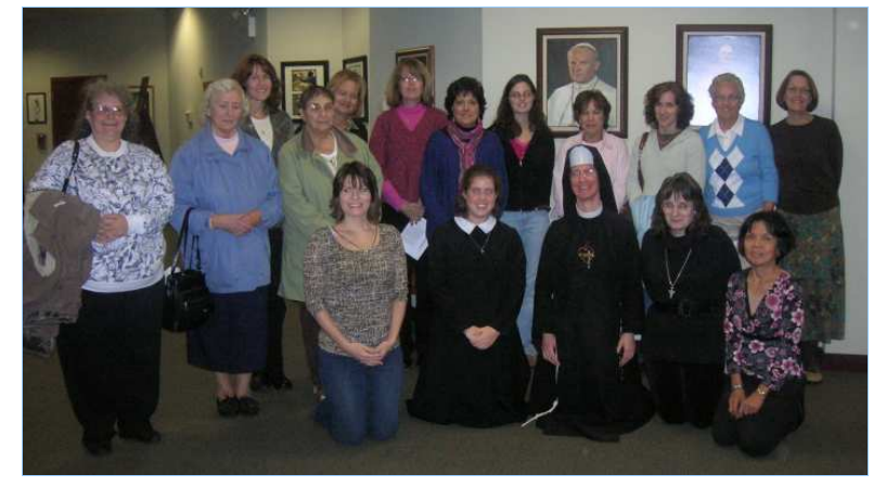
A group of Lay Associates at St. Jane De Chantal Parish in Easton, PA

Lay Associates of the Sister Servants of the Most Sacred Heart of Jesus