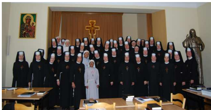
Delegate Sisters participating at the General Chapter, July 2010