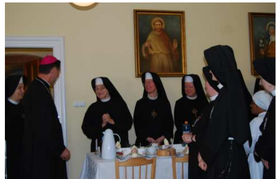
Moments of Recreation and Sharing...

Every six years, our Congregation holds its General Assembly called the General Chapter consisting of Sisters representing the various countries in which we serve. The aim of the General Chapter is to evaluate the spiritual and apostolic activity in regard to the charism of our Congregation; the Sisters' formation at all levels; temporalities; and suggestions submitted by the Sisters for the future and growth of our religious family.