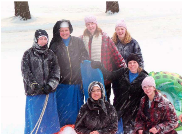
To Remember Winter!