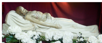
One of many "tombs of Jesus" in Poland

On Good Friday or Wielki Piatek , after 3 p.m., which is the time when Jesus