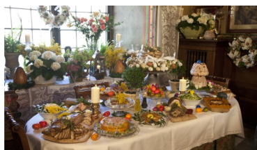
Easter Breakfast Table

On Easter Sunday morning, a beautifully set table is prepared and covered with pisanki, ham, sausage, cold meats, salads and relishes, including cwikla, made with grated beets and horseradish, bread, babki, mazurki, and other pastries, and, in