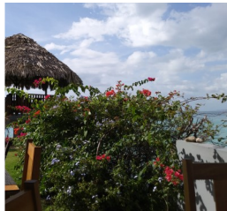
Floral & Coconut trees