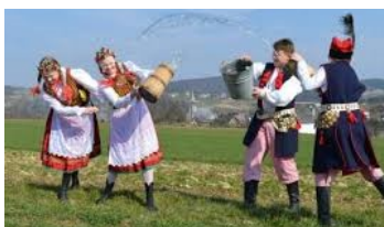
Smigus- Dyngus—Wet Monday

Easter Monday is a holiday in Poland. Wet Easter Monday (Lany poniedziałek / śmigus-dyngus) was traditionally the day boys tried to drench girls with squirt guns or buckets of water. The girls had their chance for revenge the following day. Now the Monday is usually celebrated by everyone drenching or sprinkling each other. According to Rev. Krysa, Dyngus Day is a commemoration of the birth of Christianity in Poland (966 A.D.) in which Holy Baptism was administered to Prince Mieszko on Easter Monday, uniting all of Poland under the banner of Christianity. The Dyngus custom is also reminiscent of the mass Baptisms that took place in the Lithuania after the marriage of Polish Queen Jadwiga and Lithuanian Duke Jagiello.