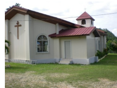
Holy Spirit Church, Maggotty