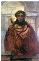
"Ecce Homo", painted by St. Albert Chmielowski

Polish Lenten and Easter traditions are as old and beautiful as the Polish Christmas traditions, and they require just as much elaborate preparation. These traditions celebrate not only the central mystery of the Catholic faith, the Passion and Resurrection of Jesus Christ, but also the coming of spring and the long-awaited rebirth and renewal of nature after the long, dark months of winter. The Polish name for Easter is Wielkanoc , which means Great Night-the night from Holy Saturday to Easter Sunday-when the miracle of the Resurrection took place. Lent or Wielki Post , the six-week period of religious preparation for Easter, a time of fasting and prayer. Stations of the Cross and Gorzkie Zale are two religious traditions observed during Lent. Gorzkie Zale , or Bitter Sorrows, are beautiful hymns or lamentations sung on Friday evenings and Sunday afternoons in Lent. These are ancient chants, retracing the Passion and Crucifixion, and their soulful notes ring out of all churches in cities and villages in Poland.