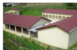
The Community Center (left) Holy Spirit Clinic (right) in Maggotty.

The convent, rectory, Holy Spirit Church, community center, a sausage factory, medical clinic, doctors house and a soon to be food and clothing bank were located in the niche of the mountains of the Maggotty—and what a beautiful sight it was! To realize that this was once uninhabitable "bush land" was amazing!