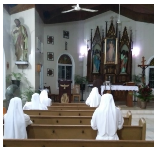
Sisters of the Sacred Heart praying at the Holy Spirit Church, Maggotty Jamaica

Glory Be to the Most Sacred Heart of Jesus