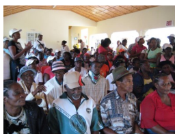
Waiting to see a doctor