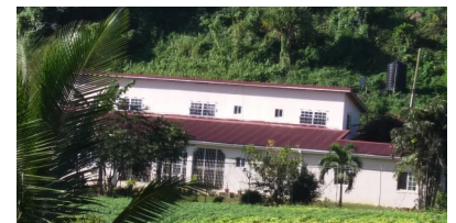
Doctor's Residence Maggotty

The convent, rectory, Holy Spirit Church, community center, a sausage factory, medical clinic, doctors house and a soon to be food and clothing bank were located in the niche of the mountains of the Maggotty—and what a beautiful sight it was! To realize that this was once uninhabitable "bush land" was amazing!