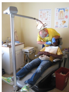
A volunteer Doctor—dentist