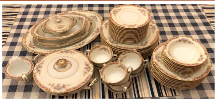
The wedding dishes, a miraculous sight.

All of them stared incredulously and in awe at this miraculous sight. The plates were unbroken, the cups still hung from their hooks, and an inch of mud was atop the saucers! To their further amazement, there, stuck with floodwater to the glass door of the china cabinet, was a plastic Sacred Heart badge, its origins a mystery.