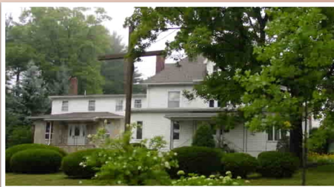
St. Maximilian Kolbe convent, Cresson, PA, our earthly, temporary home, a stop before we enter our eternal home — in the Heart of Jesus, Abode of love.

We all long for a place where we are completely loved, accepted, and treasured – where people wait for us. Where we belong.