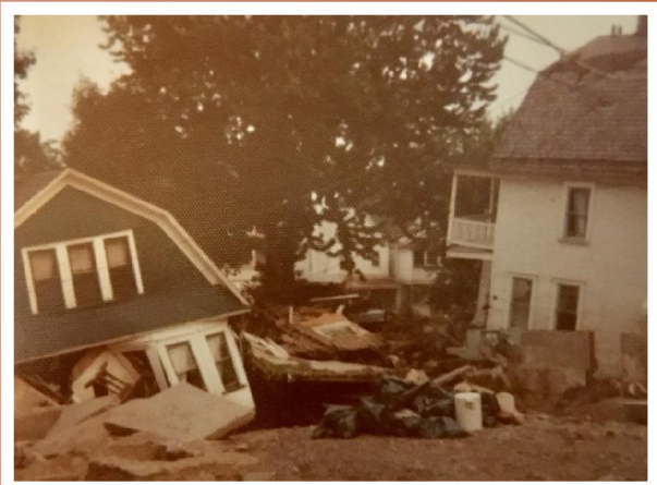
Devastation of Hurricane Agnes—June, 1972

My parents were among the many in higher elevations of the city to open their doors to friends and relatives displaced by the flood waters. Desperate people filled churches and gathered around television sets as national news reported the near apocalyptic devastation hitting the region.