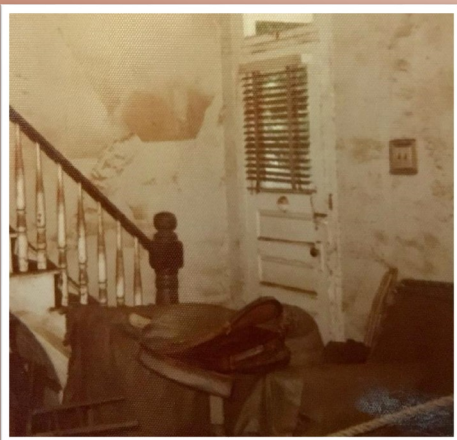
Grandparents’ home — everything destroyed.

After the waters had crested and receded, residents were permitted back into the flood plain of the city. Family members walked through their neighborhood in South Wilkes-Barre, assessing the waters’ toll, viewing scenes that resembled a war zone.