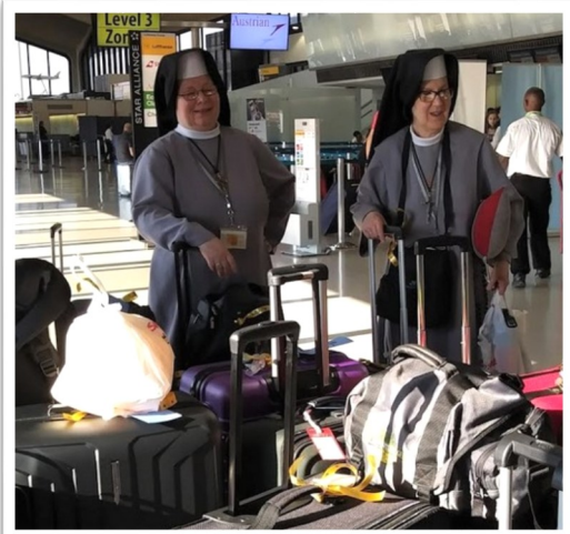
The Epic Journey begins!

On Jubilee Pilgrimage to Poland—Walking in the Footsteps of our Saintly Founders: St. Joseph Sebastian Pelczar and Blessed Klara Szczesna