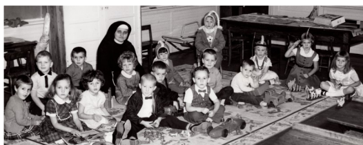
Kindergarten in Portage, Pennsylvania